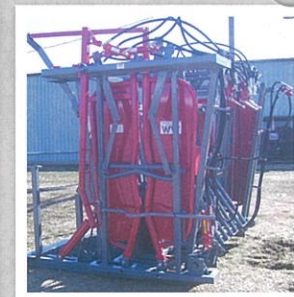
Hydraulic Neck Bar