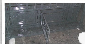
50/50 Milk Door