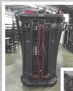
Bifold Headgate and Tailgate