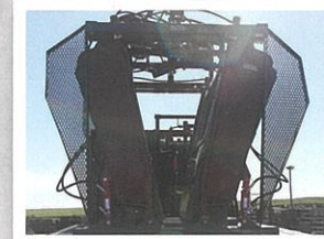
Hydraulic Gate Guard