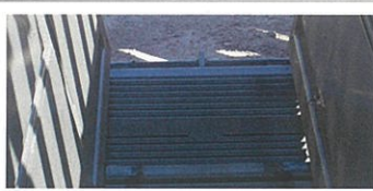
3/4" Hot Roll Floor