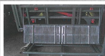
Two Piece Fall Out Floor