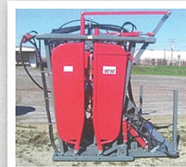
Adjustable Tailgate Gate Feet